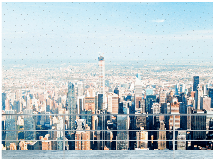
Interior view: The semi-transparent markings of ORNILUX® design dots are barely noticeable when seen through.